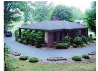
Tami and Jaga bought their first house near Asheville, NC