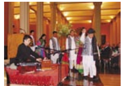
Afghanistan Fundraiser at the Landmark Center