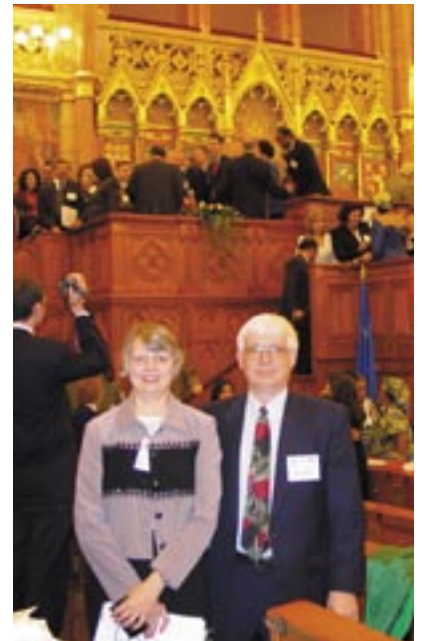
At the Parliament in Budapest