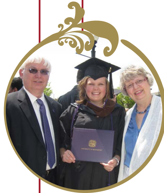
Greta Graduates 2011